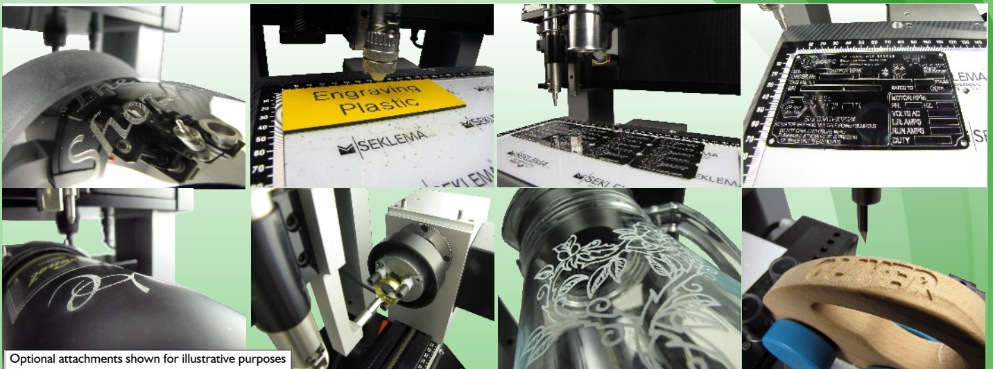
Optional attachments shown for illustrative purposes